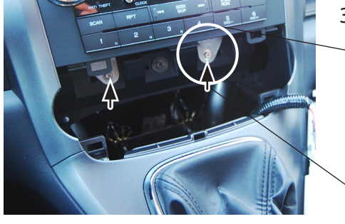
3. Remove the two screws below the OEM head unit