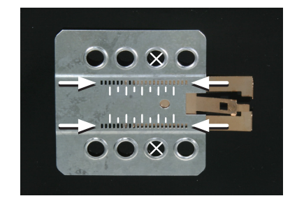
The position of the copper coloured holder can be adjusted to your needs for perfect fit. (see sample)