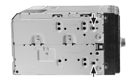
Mount the metal brackets with the double DIN head unit