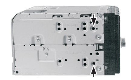
Mount the metal brackets with the double DIN head unit