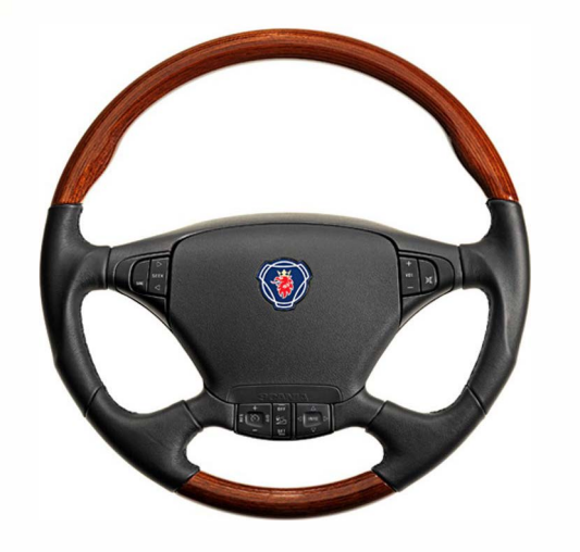
Steering Wheel Control Functions